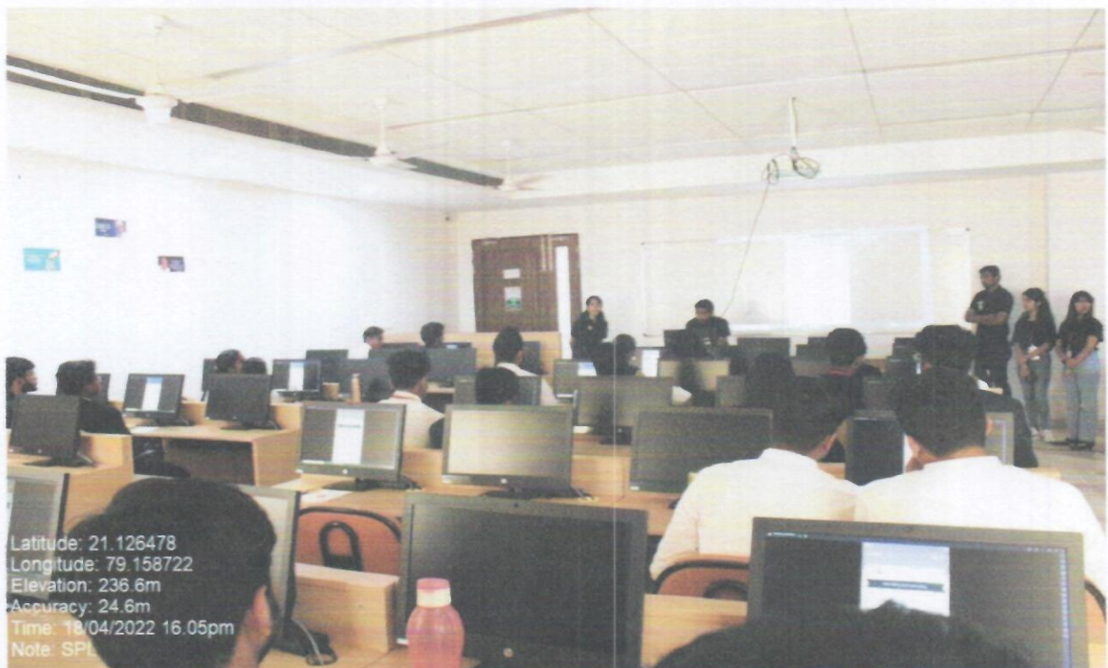
DAY 1 – 18/04/2022 – MOCK IPL AUCTION IN FULL SWING

Latitude: 21.126478 Longitude: 79.158722 Elevation: 236.6m Accuracy: 24.6m Time: 18/04/2022 16.05pm Note: SPL