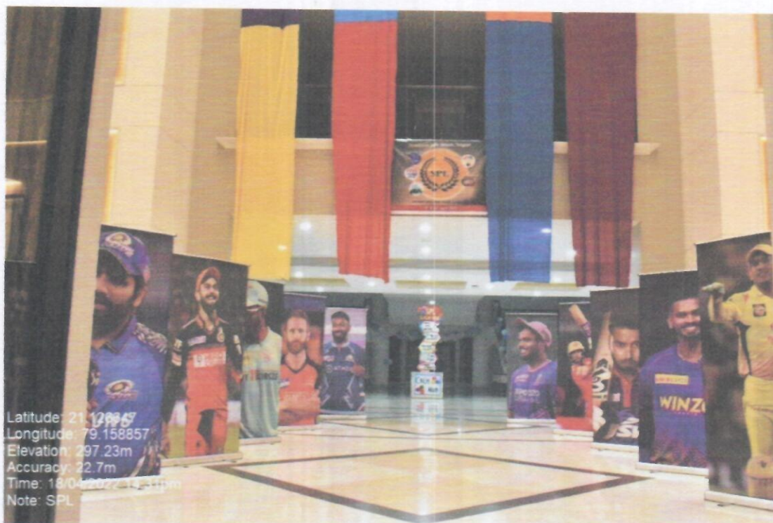
SPL DÉCOR AT THE ENTRANCE

The Trade Fair was an informal gathering where the students had put up stalls for refreshments and beverages – which also received a good response from the students and staff of SLS, Nagpur. The prize distribution ceremony will be held in the first week of May 2022; in the Assembly Hall; where all the winners will be given prizes and certificates. For every event – there are 3 positions viz. second runner up, first runner up and the First place.