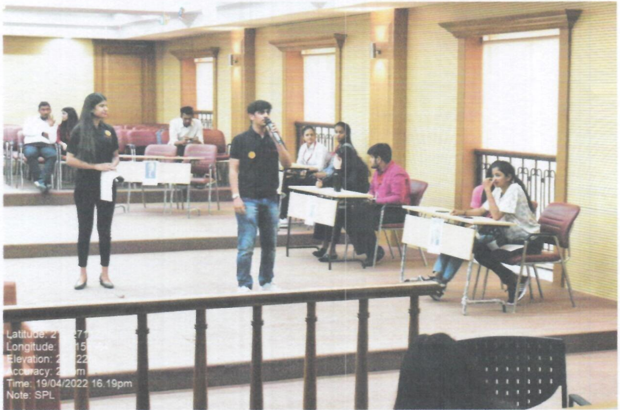
DAY 2 – 19/04/2022 – QUIZ