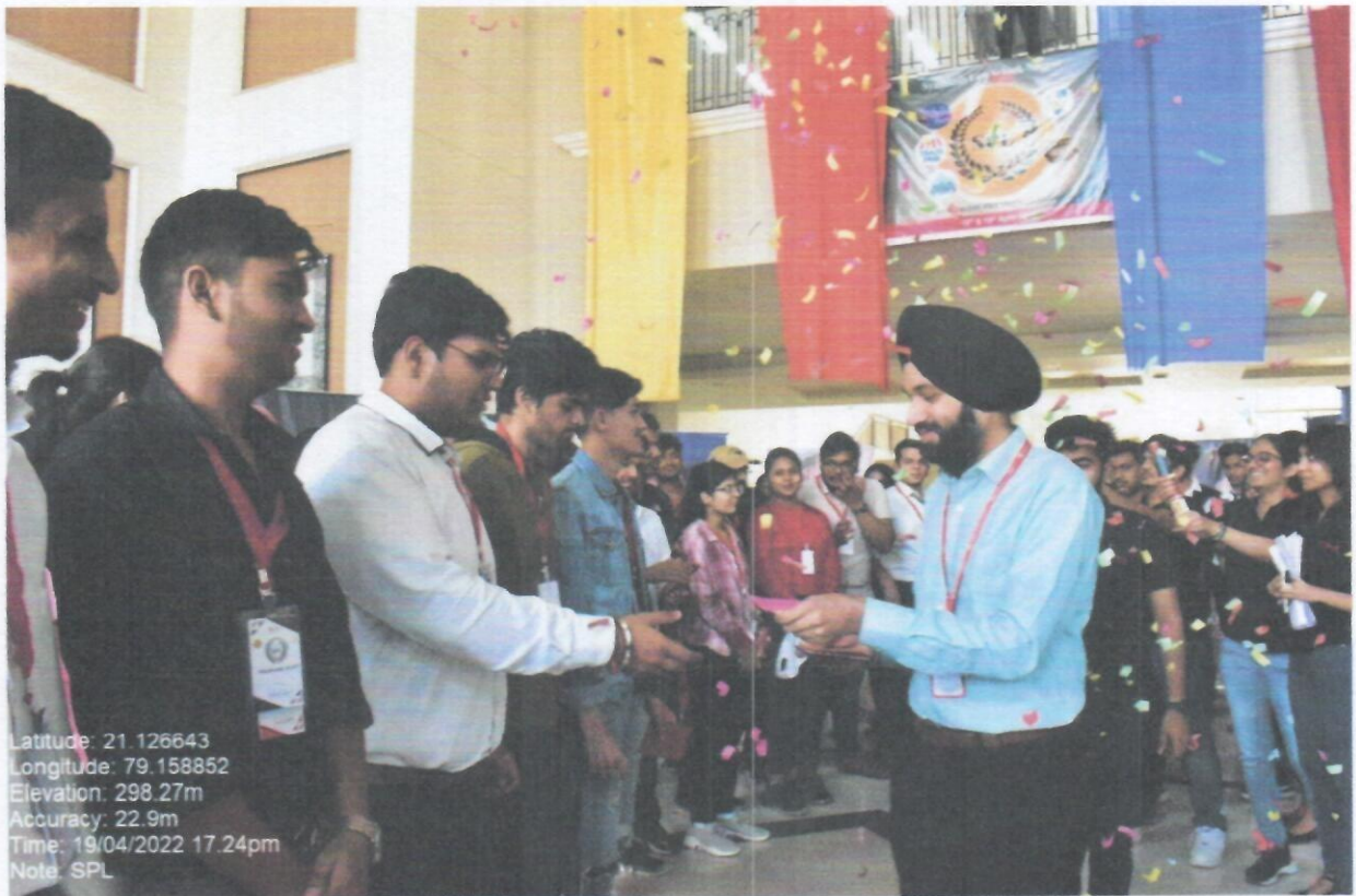
DAY 2 – 19/04/2022 – TREASURE HUNT (CLUES HANDED OVER TO THE TEAMS BY OUR DIRECTOR)