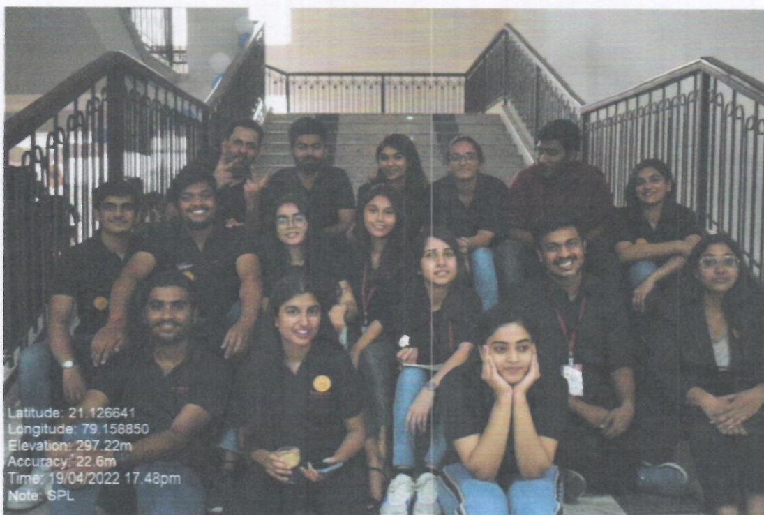
TEAM CALM HUB - THE EVENT ORGANISING TEAM